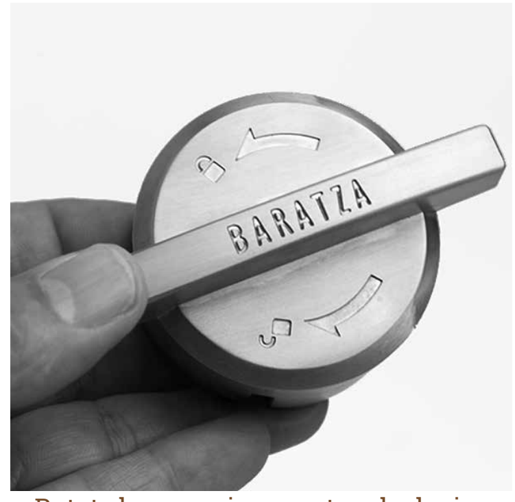
Rotate burr carrier counter clockwise to lock in place.