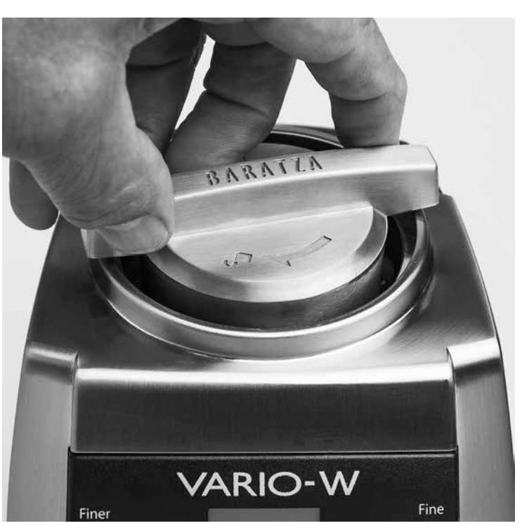
Rotate Baratza burr tool clockwise to remove the burr carrier.

Using the Baratza Burr Tool included with the grinder, rotate the metal burr carrier clockwise about 1/6th of a turn, then lift the burr carrier straight up and out of the grinder housing. You may need to wiggle the burr carrier a little to get it free.