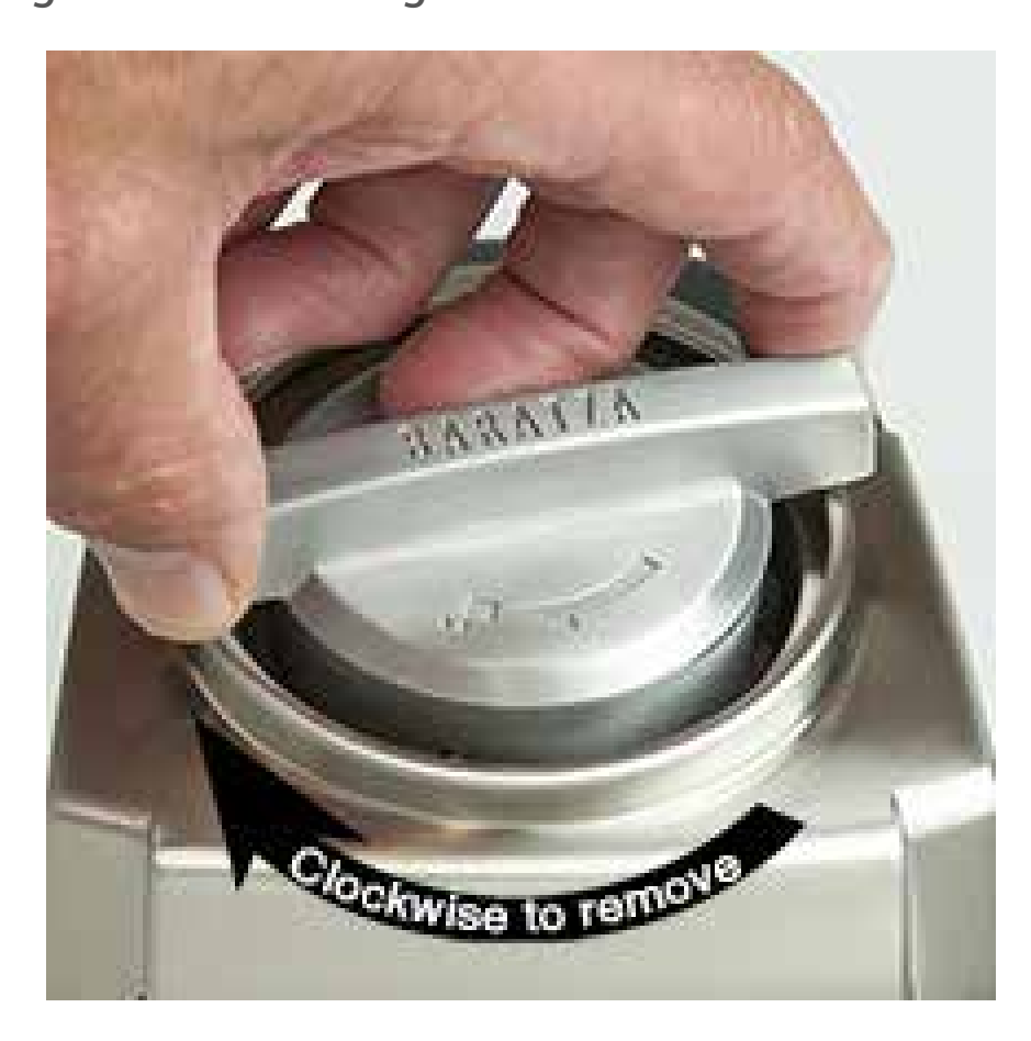
Turn burr clockwise to remove

Wash the grounds bin, hopper, and the hopper lid in warm soapy water, then rinse and dry.