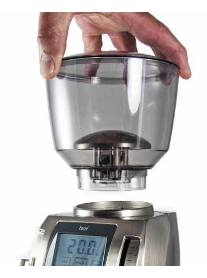
Insert the bean hopper then rotate clockwise to lock in place.

Place the Forté grinder on a level surface. With the hopper lid in place, mount the hopper on the grinder housing by lining up the two small tabs at the base of the hopper with the two slots inside the collar on the top of the grinder. The Open/Closed lever should be oriented to the back of the grinder.