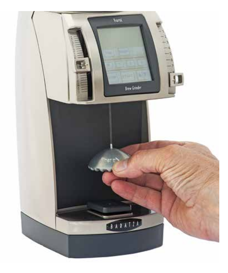
Use the burr calibration tool while the grinder is running.

Turn the grinder on and lower the Macro and Micro levers, all the way to the bottom. Let the grinder run long enough to expel any remaining ground coffee. Remove the grounds bin (For Vario-W and Forte, TARE the grinder). Now press any one of the preset buttons, then press START and insert the Calibration tool into the 2mm Allen head screw (The grinder will run until you press the STOP button). With the motor running, move the Macro arm up to the top (setting 1). You should not hear any change in motor speed. Now, slowly move the Micro arm up to