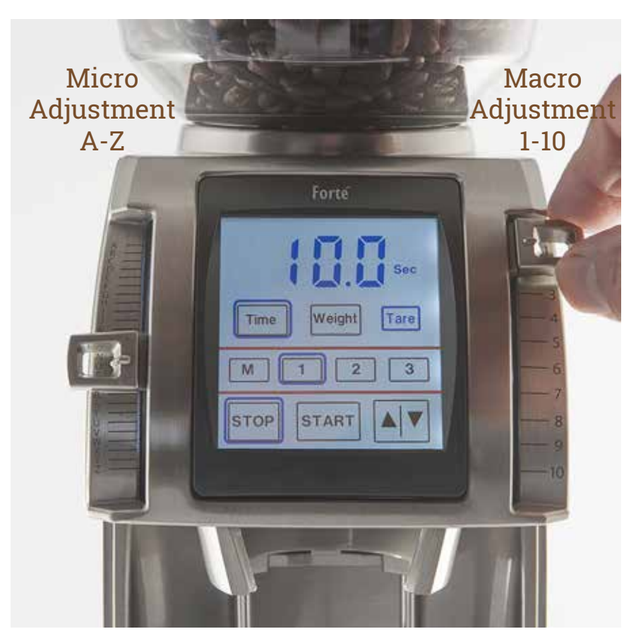
The Forté™ must be running when grind adjustment are made.

Starting brew settings can be found at www.baratza.com under the Support tab.