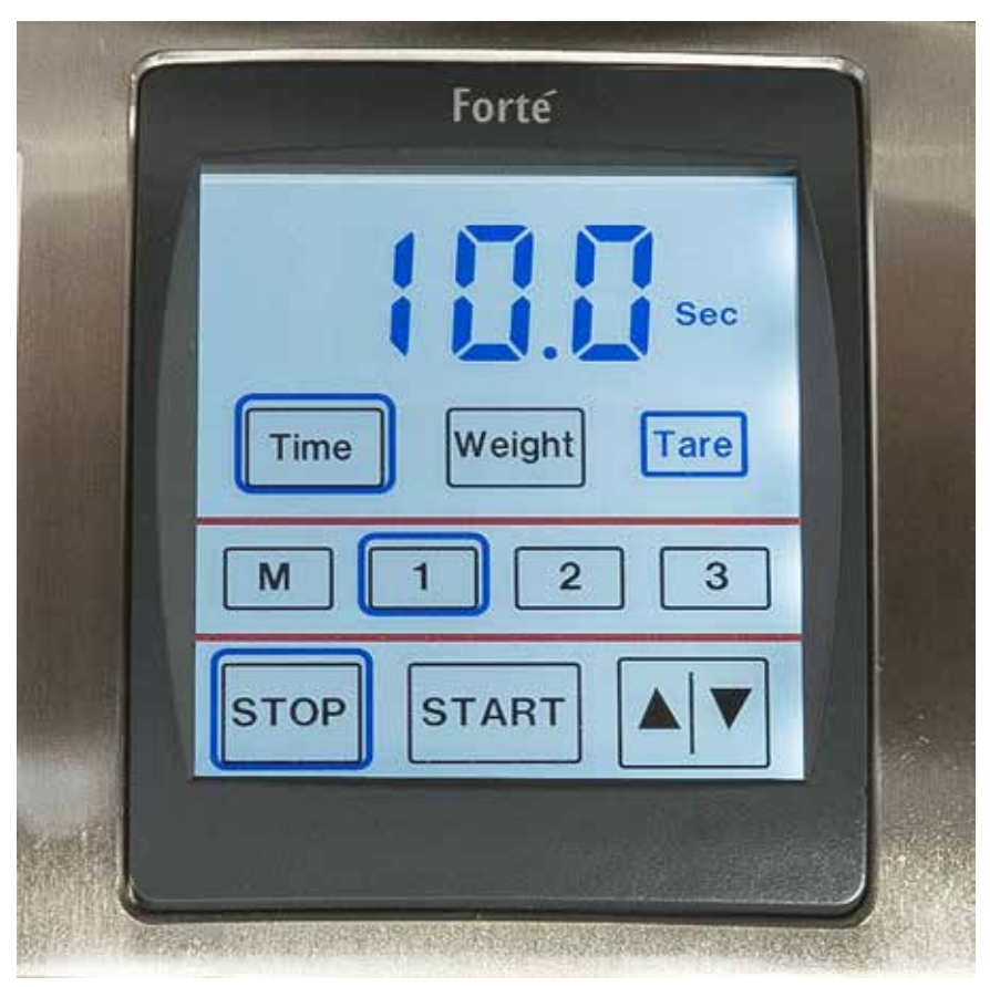
All Weight and Time settings are made using the touch screen.

While grinding, the screen will display in real-time, the weight of coffee in the grounds bin. When the screen reaches the programmed weight (+/- 0.2g), the motor will stop and the screen will show the actual weight in the grounds bin for 3 seconds, then the screen will reset to the programmed weight. The